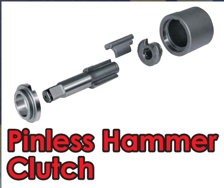
Pinless Hammer Clutch